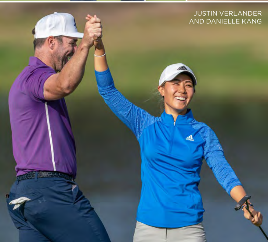
JUSTIN VERLANDER AND DANIELLE KANG