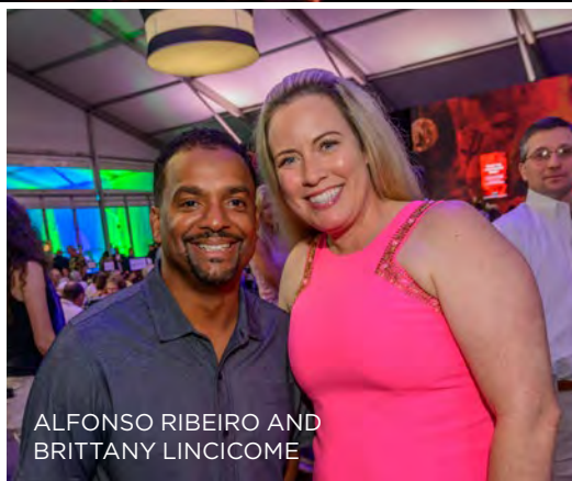
ALFONSO RIBEIRO AND BRITTANY LINCICOME